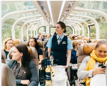
Complimentary Wine & Cheese